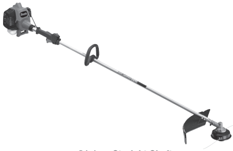
21.1 cc Straight Shaft Grass Trimmer TCG22EASSLP