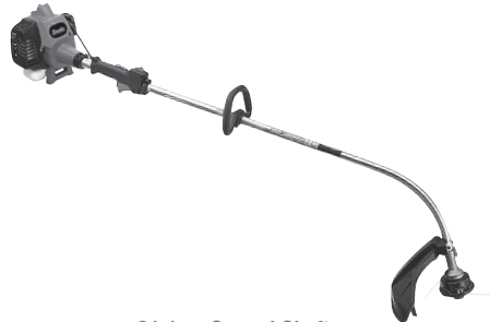
21.1 cc Curved Shaft Grass Trimmer TCG22EABSLP