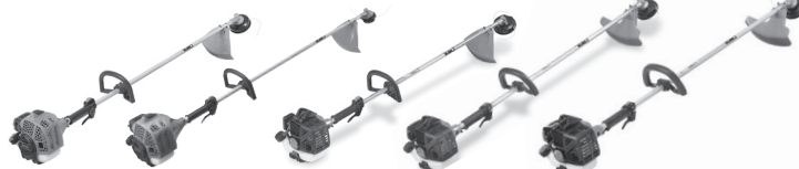
Straight Shaft Trimmers TBC-240PF / TBC-240PFS / TBC-255PF / TBC-260PF / TBC-280PF