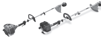
Split Boom Trimmers TBC-240SFS / TBC-260SF