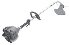
Curved Shaft Trimmer TBC-240PFCS