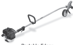
Portable Edger TPE-260PF